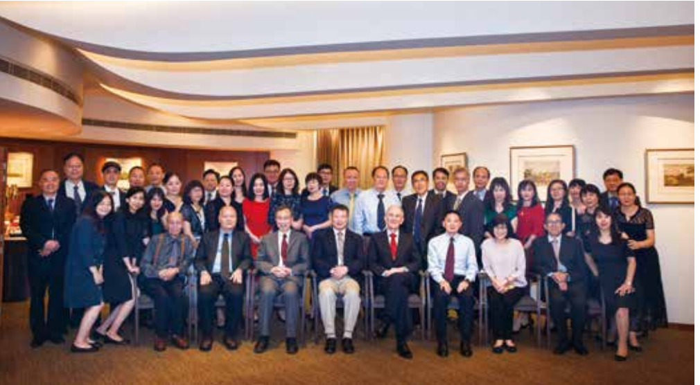
瑞德成立 40 周年庆典

都得到提高。我们的生产技术应用非常广泛。中国的生产技术发展 非常快,技术应用和转换效率也非常快。2019年瑞德电子(信丰) 有限公司的总产值将超过瑞德电子(深圳)有限公司。"