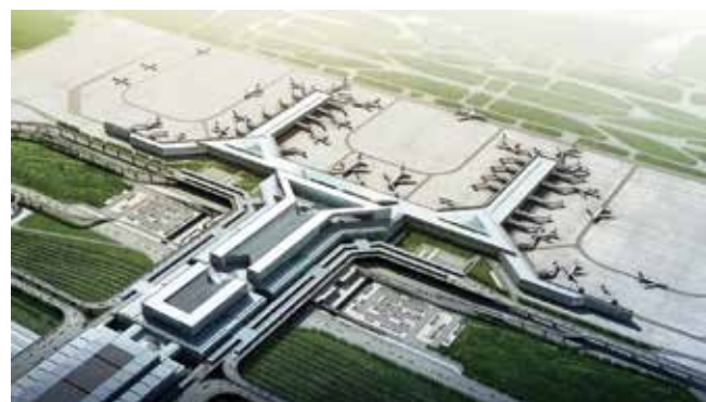
LHC为上海机场集团提供国际酒店品牌运营方猎寻服务 International Hotel Operator Search for Shanghai Airport