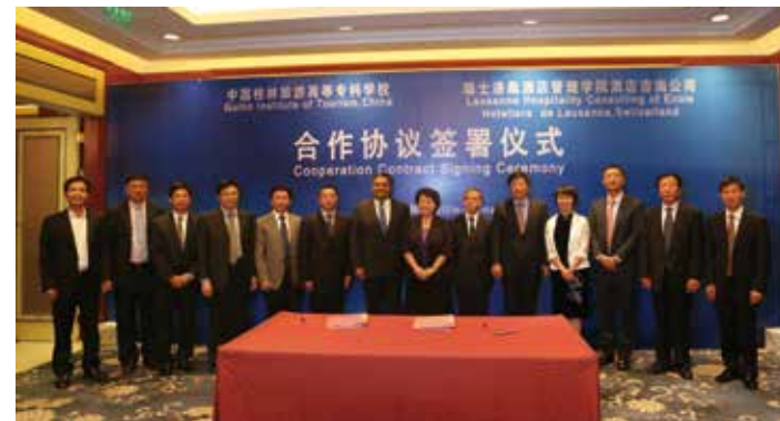
桂林旅游学院签约仪式合影 Signing Ceremony at Guilin Tourism University

high attention from the best hospitality school in the world. Meanwhile, the Chinese economy as well as hospitality industry, which is under high speed development, was in great need of hospitality talents and expertise for developing hospitality projects, which makes LHC and Chinese hospitality industry a win-win relationship.