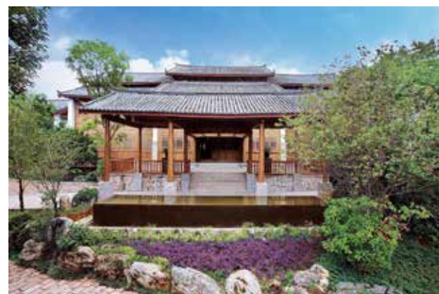
LHC为中国丽江大研安缦提供业主代表和资产管理服务 Asset Management and Owner Representative Service for Aman Dayan