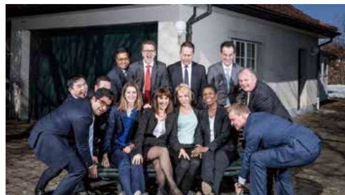
LHC 团队合影 国际视野 多元化履历 LHC Global Team - Multicultural Backgrounds & International Experience

In nearly 40 years of reform and opening-up, China, with GNP increased by more than 10 times, has rapidly become a significant economy entity in the world and a key drive for the global economic growth. "Ecole hôtelière de Lausanne, in fact, started its intelligence output for China over ten years ago, but it did not register any legal entity. Lausanne was conservative, it had never made overseas investment before 2014, however, as the business demands are increasing in China, the transformation and upgrade of modern service industry is at a critical stage, and Lausanne's knowledge and brand value match the demand of China's economy, the opportunity is ready for LHC to output intelligence. From registration till today, I took part in the whole process of establishment of the Greater China branch of LHC, and witnessed every step of the company growth. We are so honored to be nominated for SINO-SWISS Business Awards, and standing