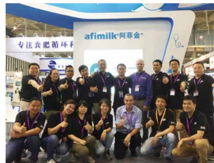
南京展会集体照 At Nanjing Exhibition

李总说：“阿菲金强调合作伙伴在整个价值链上的合理分工，通过合作伙伴推进业务发展。我们的合作伙伴是系统集成商，合作伙伴把阿菲金的核心技术和核心主件嵌入产品和方案中，然后给客