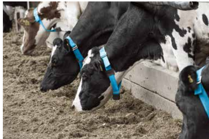
阿菲金 Silent Herdsman 项圈识别器 AfiFarm Silent Herdsman collar recognizer

Presently, Afimilk has developed long-range cooperation with a series of companies like Beijing Kingpeng, Shanghai i-ORION Machinery, CIA Beijing Husbandry Technology, Shanghai DoubleWinAgri Machinery, Milkows, Foshan Legend, Guangzhou Wanri and Skyway. Its intelligent and digitized