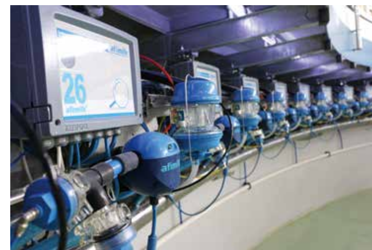
实时在线乳品质量分析实验室 Real-time on-line milk quality analysis laboratory

三是实施本地化策略。中国有 13 亿人口，作为这么大的一个国家，不可能没有自己生产的牛奶，原奶的生产还是要立足于国内。李总说：“在这个行业里阿菲金与本土企业的结合度是最高的。阿菲金提供拥有核心技术的牧场管理系统，而在经营模式上，阿菲金完全